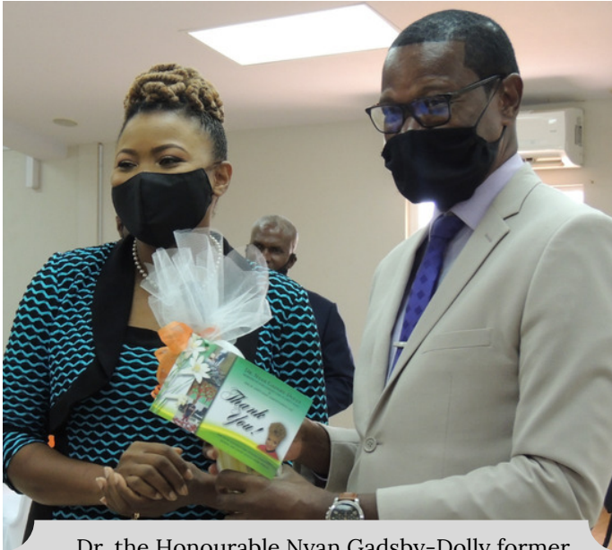
Dr. the Honourable Nyan Gadsby-Dolly former Minister of Community Development, Culture and the Arts and the Commission's CEO exchange tokens of appreciation at the Commission's Tropical Wave distribution ceremony.

Our former Line Minister Dr. the Honourable Nyan Gadsby-Dolly has been appointed as the Minister of Education. We take this opportunity to congratulate her on the next step in serving our nation as well as to express our gratitude for her commitment to the National Commission For Self Help Limited and to highlight her achievements over the last five (5) years 2015-2020.