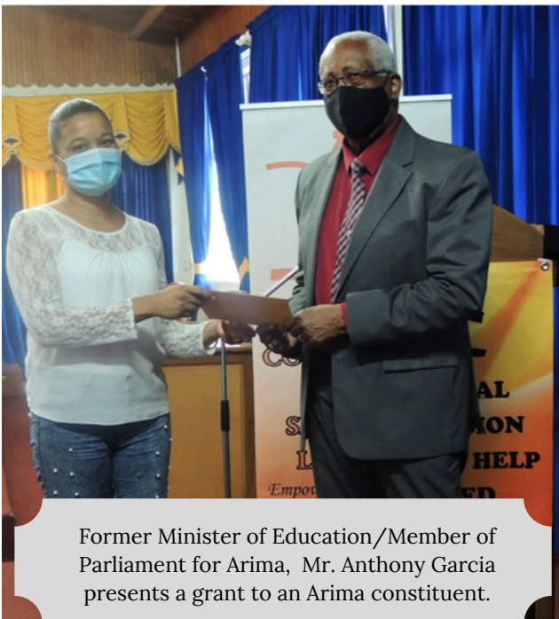
Former Minister of Education/Member of Parliament for Arima, Mr. Anthony Garcia presents a grant to an Arima constituent.