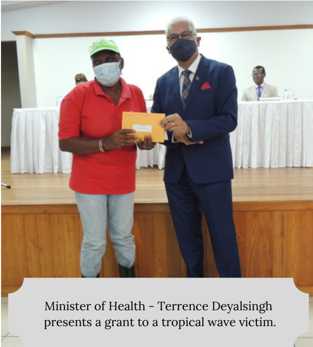
Minister of Health - Terrence Deyalsingh presents a grant to a tropical wave victim.

Grant Distribution Ceremonies took place in the constituencies of La Horquetta, St. Joseph, Diego Martin North East, Arima, Arouca/Maloney, Mt. Hope, San-Fernando, Siparia, Oropouche East and Tobago to name a few. Members of Parliament, along with community representatives, were delighted to distribute grants to their constituents which consisted of Minor Repairs/Reconstruction Grants (MRRGs) valued up to $15,000, Emergency Repairs/Reconstruction Grants (ERRAGs) valued up to $25,000 and Development Projects. Area representatives took pride in knowing these grants would bring a level of comfort to recipients, as their homes, roadways and communities would be improved.