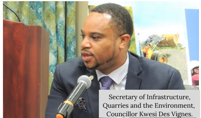
Secretary of Infrastructure, Quarries and the Environment, Councillor Kwesi Des Vignes.